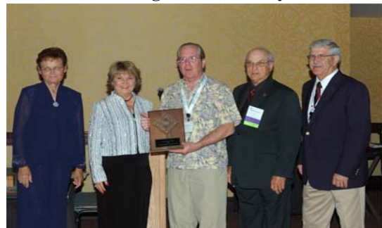
Northwest California RC&D Council