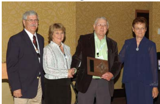
Kansas Natural Resource Foundation