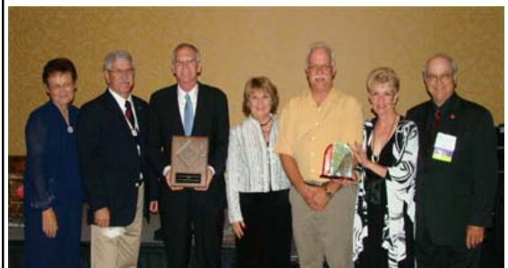
Missouri Department of Conservation