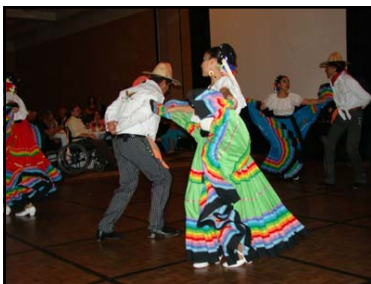
Local Dance Group at Banquet