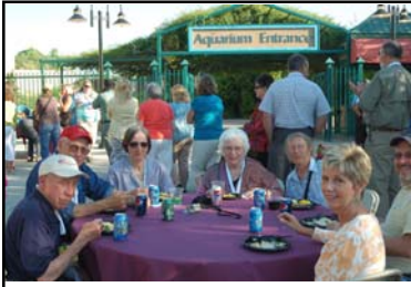
Albuquerque BioPark Aquarium