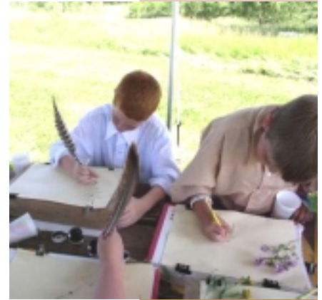
Lewis & Clark Trail - Youth shown participating in program - Loess Hills National Scenic Byway

"RC&D Continues to Improve Life in Rural America."