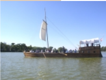
Lewis & Clark State Park - Onawa, Iowa - Keelboat

habitat; a transformation that has not only earned national recognition, but one that has evolved into a government-private sector model that has already been replicated in three other states.