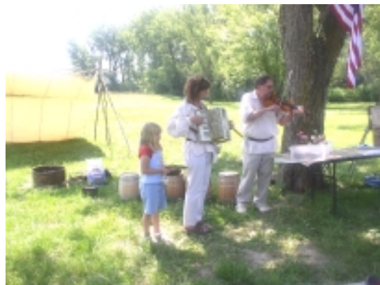
Lewis & Clark Trail - Brownville, Nebraska - Demonstration of Military Music

"RC&D Continues to Improve Life in Rural America."