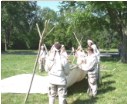
Lewis & Clark Trail - Brownville, Nebraska - Sampling Military Camp Life

The Lewis & Clark Bicentennial Commemoration will be observed in 2004-2006. Golden Hills RC&D is working with the Iowa Lewis & Clark Bicentennial Commission to plan and implement activities on the Lewis & Clark National Historic Trail in Iowa. Partnerships have also been formed with the Nebraska Lewis & Clark Commission and the Omaha Tribe. Funding for various Lewis & Clark activities has been received from the National Park Service, Iowa West Foundation and Western Iowa Tourism Region.