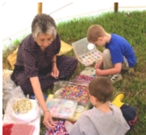
The National Catalyst

Bull Boat Making, Native American Communication, Medical Remedies, Map Making, Food Gathering and Plant and Animal Identification.